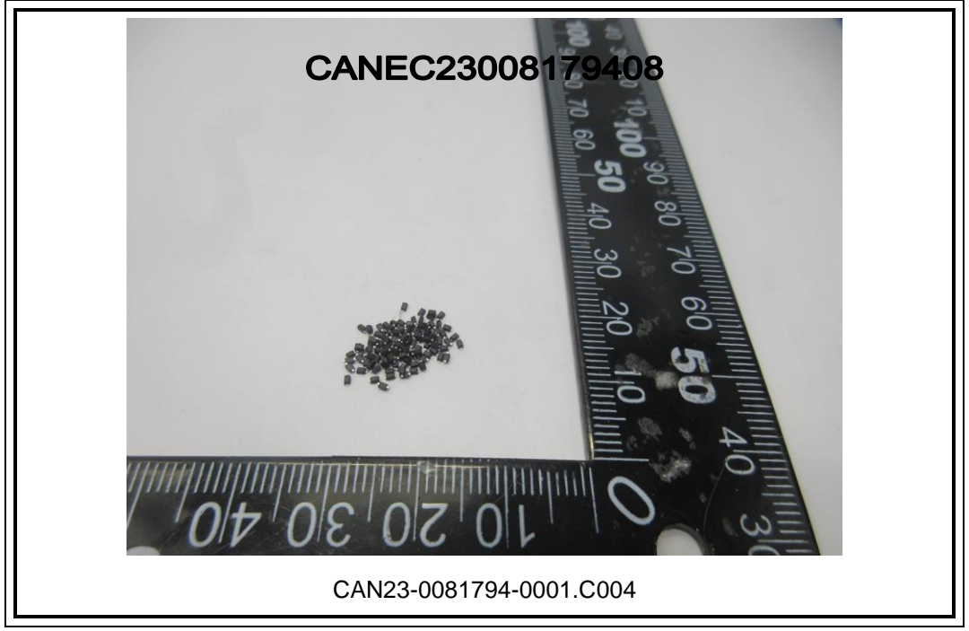
SGS authenticate the photo on original report only *** End of Report ***